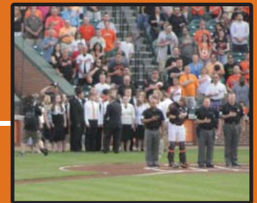
May 25, 2012: Oriole Park at Camden Yards, Baltimore, MD