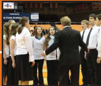
January 13, 2010: The Carrier Dome Syracuse, NY