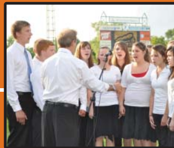
June 28, 2011: Alliance Bank Stadium, Syracuse, NY