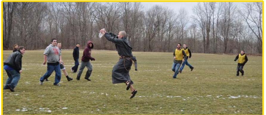
Monk + Ultimate Frisbee = Awesome Photo!