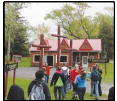
Students proceed on their walking pilgrimage toward Auriesville (above), arriving at the Shrine of North America Martyrs (below).