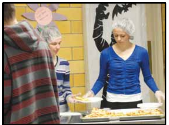
Seniors regularly volunteer to serve meals at the Karing Kitchen food shelter in Oneida.