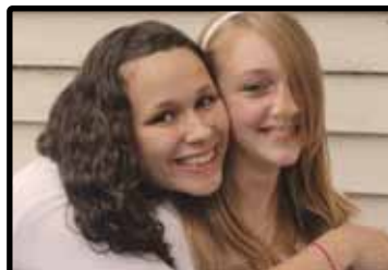
Strong friendships among our students is a primary reason for HCA's vibrant culture.