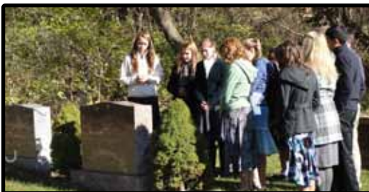
10th graders pause to pray before a gravestone in observance of All Souls' Day on November 2.